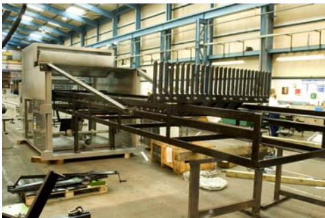
Back Raked RM in production