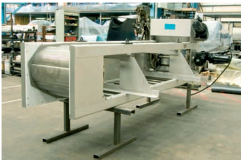
Stormguard in production at our Huddersfield plant