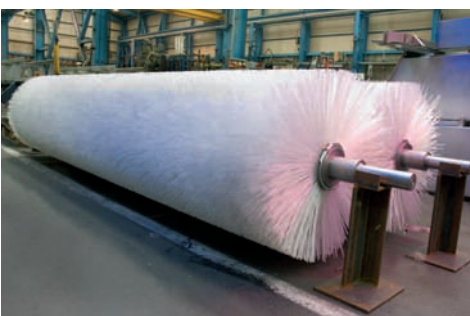
450mm diameter Escalator Brushes