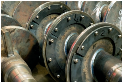
Combi-Wash helical screw